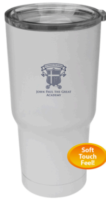
A. JPG Tumbler (20oz.) – White