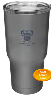
B. JPG Tumbler (20oz.) – Charcoal Grey