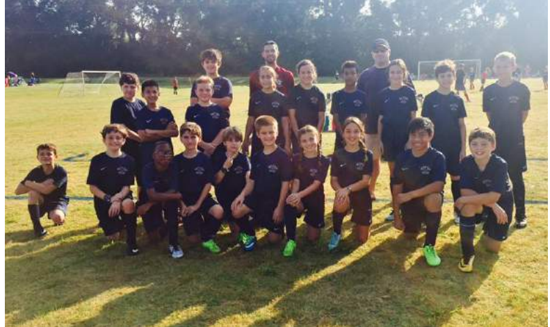
5TH/6TH GRADE SOCCER — Our first ever 5th/6th grade co-ed soccer club is off to a great start to their season!